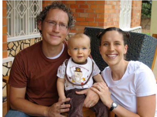
Thanksgiving 2009 was truly a time to think back over the year and count our many blessings!